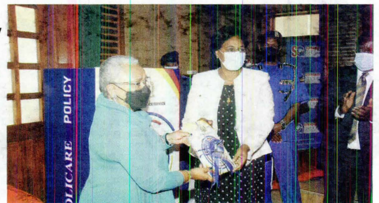
First Lady Margaret Kenyatta and Gender Affairs Cabinet Secretary Margaret Kobia during the launch of Policare, the National Police Service (NPS) Gender-Based Violence Response Programme at Kenya School of Government, Lower Kabete.