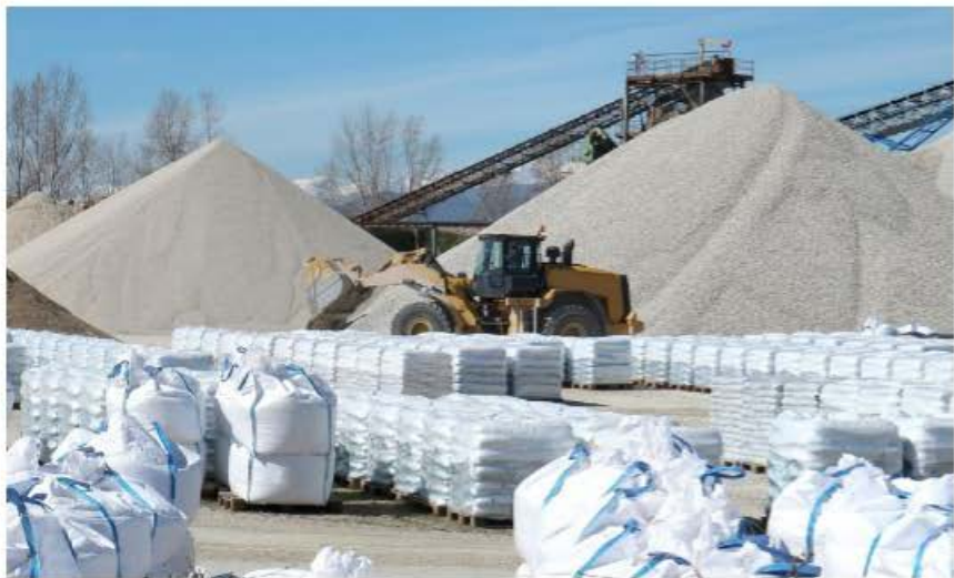
Bamburi Cement is part of LafargeHolcim, which operates in 80 countries around the world