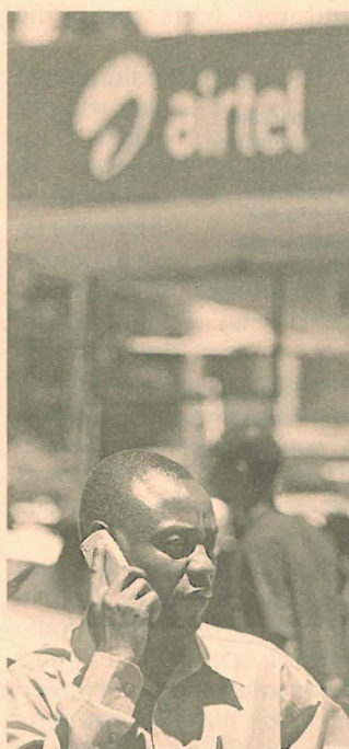
A man makes a phone call outside an Airtel shop in Nairobi. --FILE