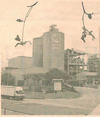
Bamburi Cement factory Athi River.

The company said it has signed a power purchase agreement with MOMNAI Energy Limited to set up two solar plants adjacent to its Mombasa and Machakos factories.